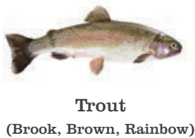
Trout (Brook, Brown, Rainbow)